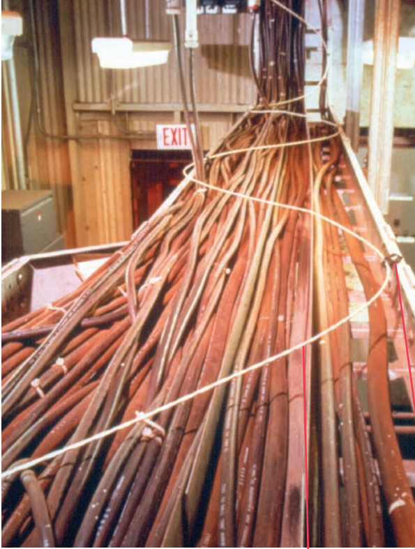
Photo taken at: Bethlehem Steel Corp. Sparrows Point Plant, Sparrows Point, Maryland, U.S.A.