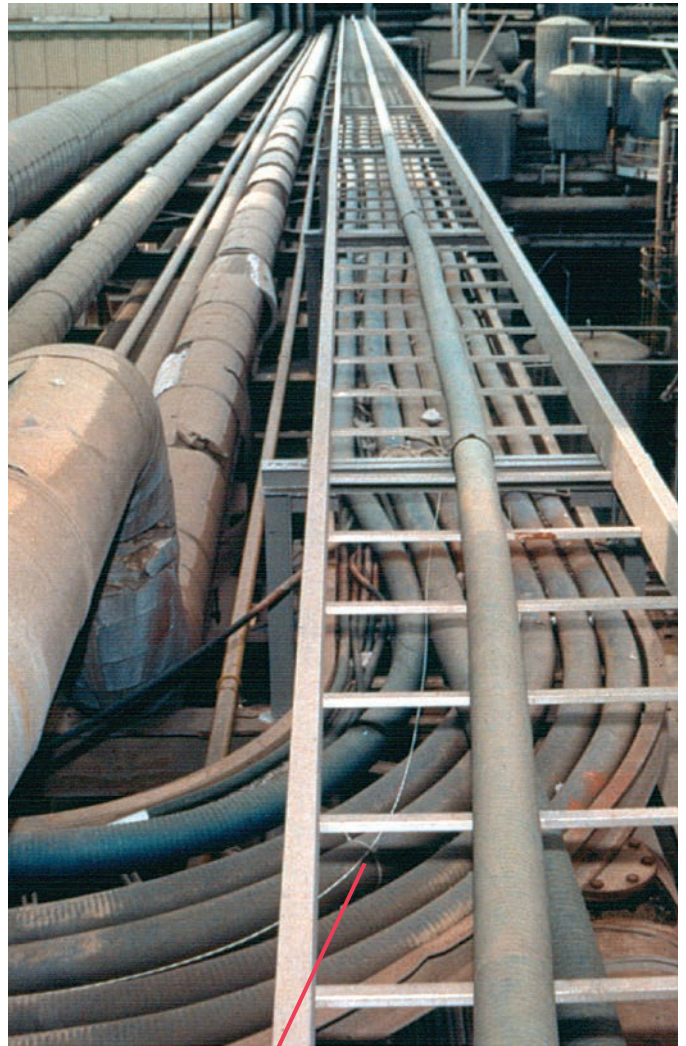
Protectowire Linear Heat Detector

Protectowire Linear Heat Detector is a component of a complete family of fire detection systems manufactured by The Protectowire Company.