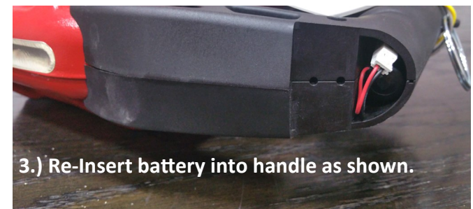
3.) Re-Insert battery into handle as shown.