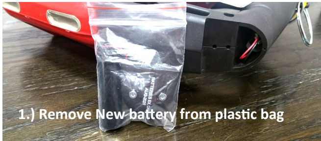
1.) Remove New battery from plastic bag