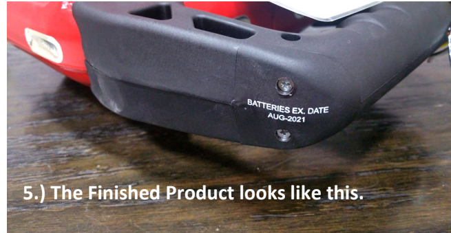
5.) The Finished Product looks like this.