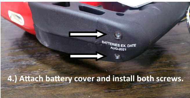
4.) Attach battery cover and install both screws.